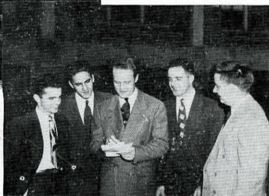
The M.S.M. Committee